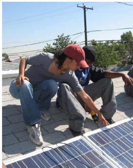
Groundwork Denver's youth "Green Team" installs solar panels on a roof. The Green Team works each week to accomplish various environmental tasks.

On June 23 and 30 the youth and a few adults from northeast Denver attended training in photovoltaic installation in advance of a real installation they will work on in a few weeks. One of the goals of the Green Team program is to introduce young people from Denver's inner city neighborhoods to green job opportunities for their future.