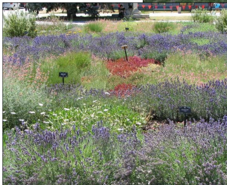
Above: The grass around the big blue bear will be replaced by a Xeriscape garden.